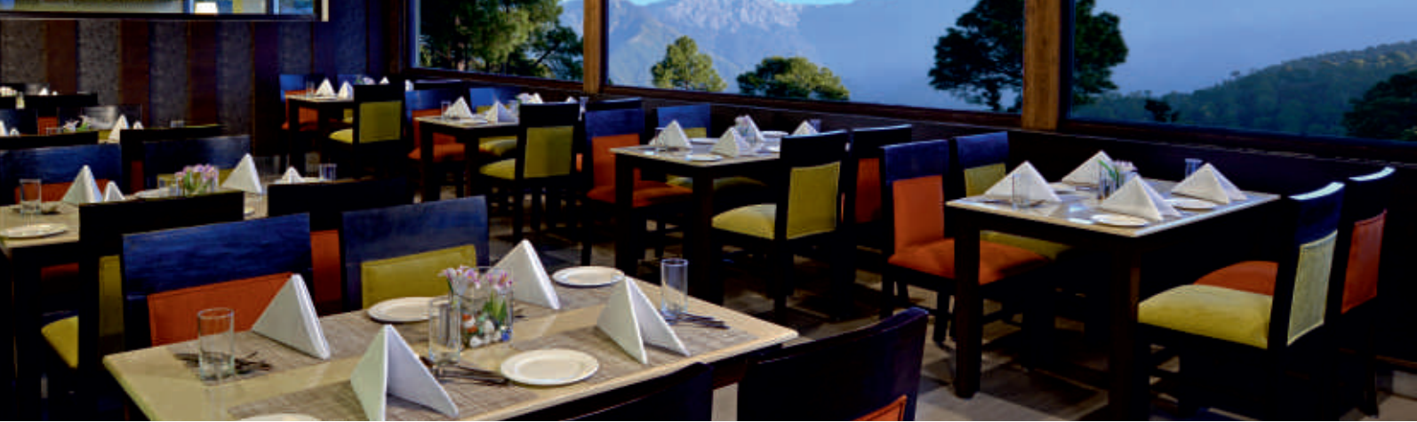
Orchid - the multi-cuisine restaurant