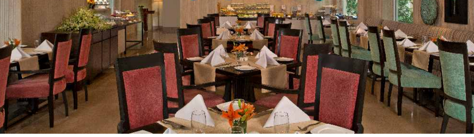
Gardenia - the multi-cuisine restaurant