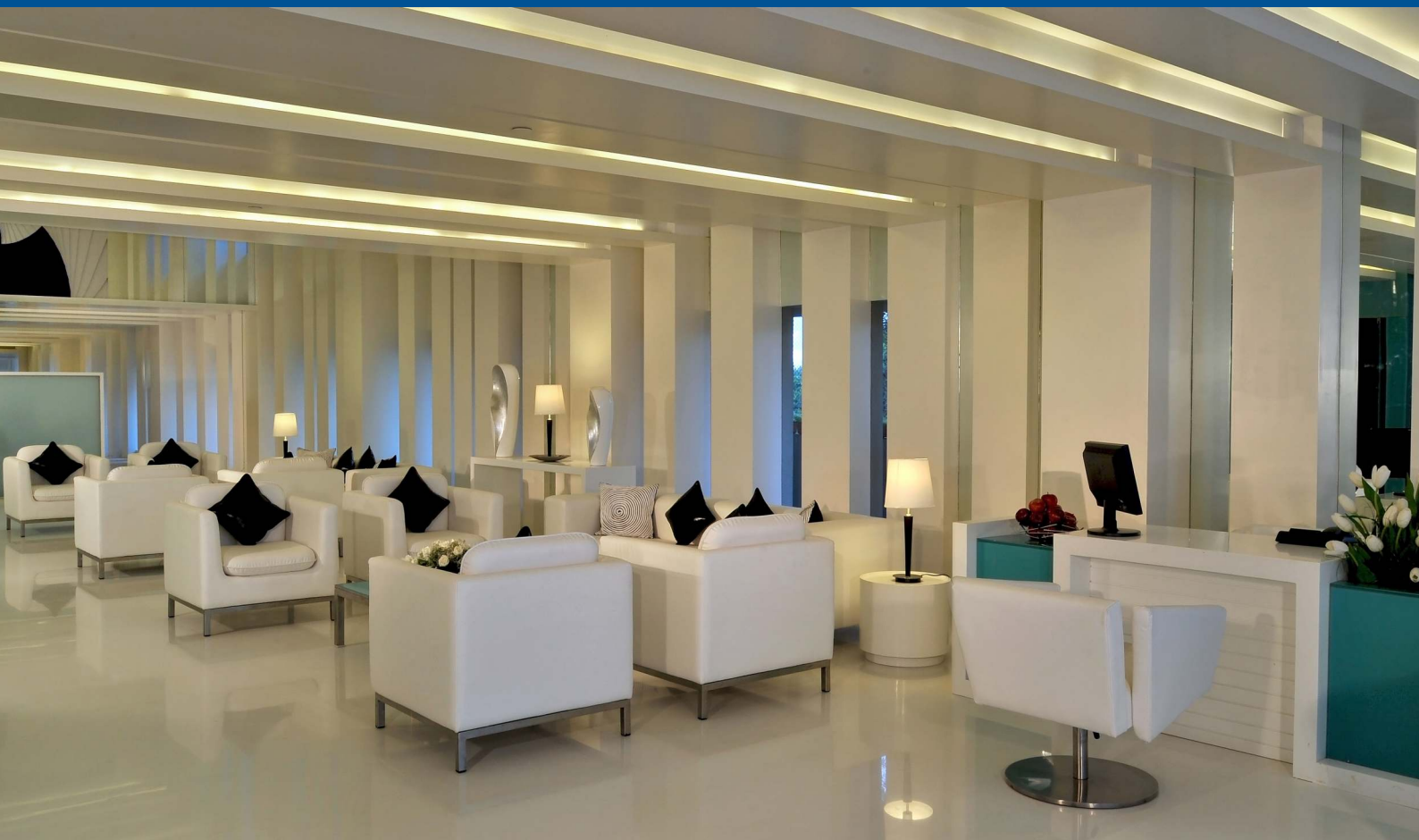
A view of the Lobby

Fortune Inn Exotica is strategically located off the Mumbai Pune Expressway, on the main Hinjewadi-Wakad Road. It is a part of Rajiv Gandhi Infotech Park which is the hub of Pune's multi-billion dollar IT industry. The hotel is within 5 kms. of the major IT companies, 27 kms. away from the Pune Airport and 18 kms. from Pune Railway Station. Aesthetically designed interiors and a modern-day ambience combined with traditional Indian hospitality make your stay at Fortune Inn Exotica a pleasant experience.