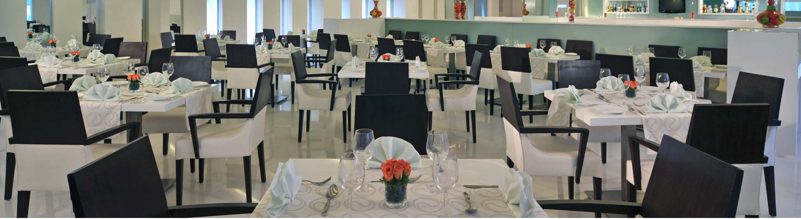
Orchid - the multi-cuisine restaurant