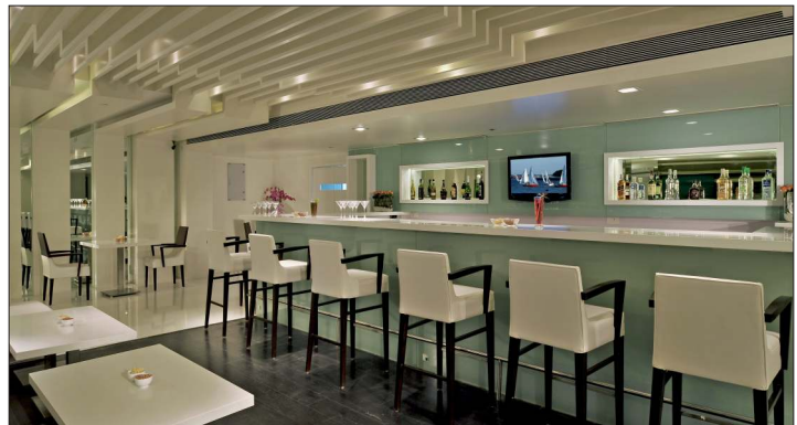
Neptune - The Bar